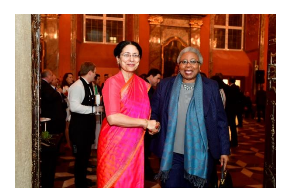
Ambassador Mosholi at the reception on the occasion of the National Day of India